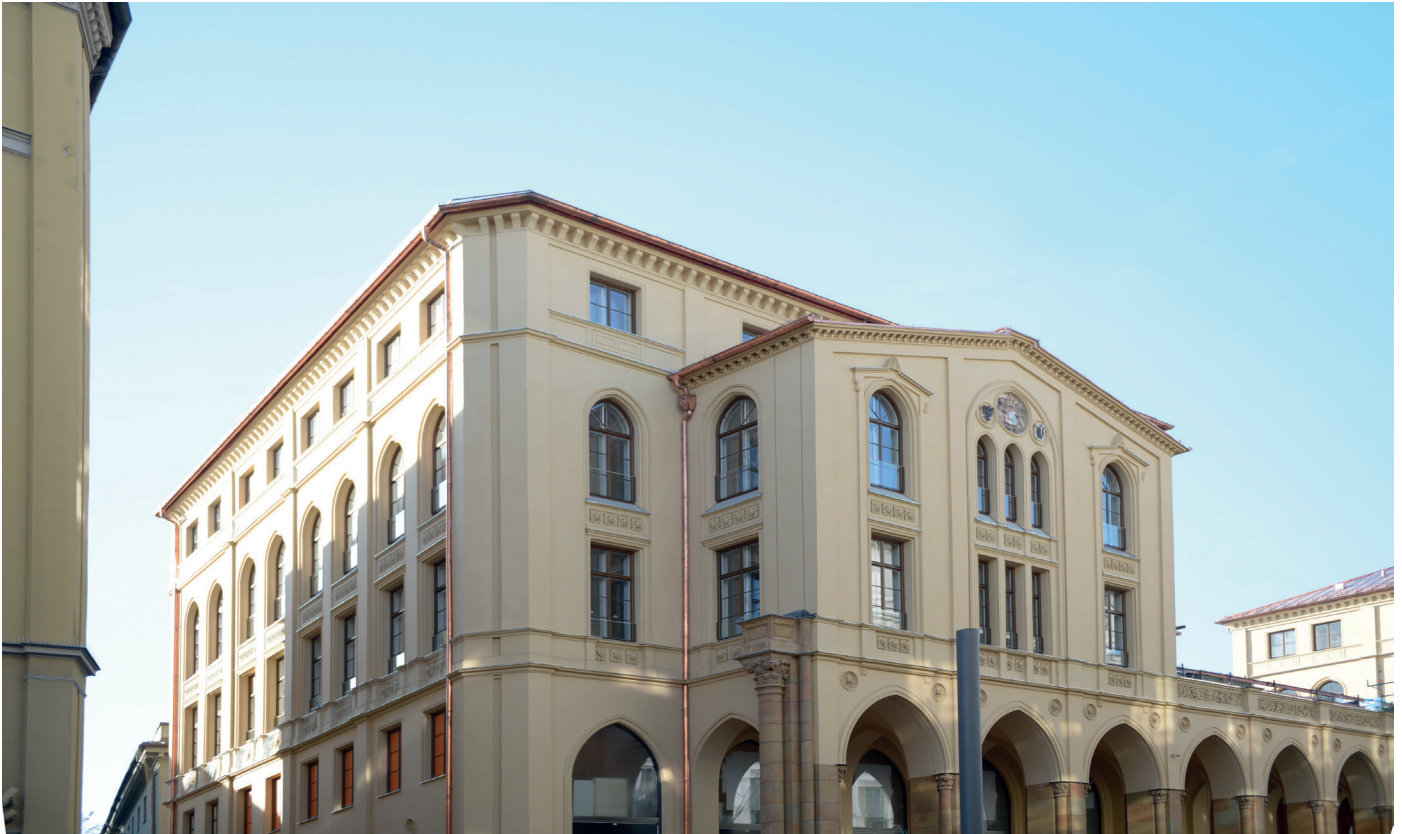
External Thermal Insulation Composite System